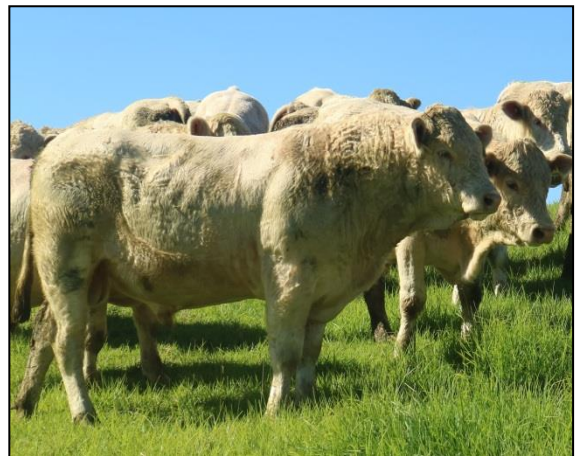
2022 Sale Bulls on offer.